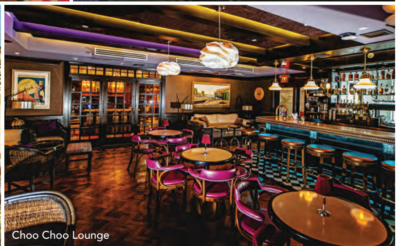
Choo Choo Lounge