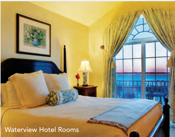
Waterview Hotel Rooms

Our property offers 80 guest rooms/suites in our main hotel, two guest houses featuring 14 private rooms, seven vacation villas with two bedrooms each, and a spectacular waterfront Lighthouse Suite.