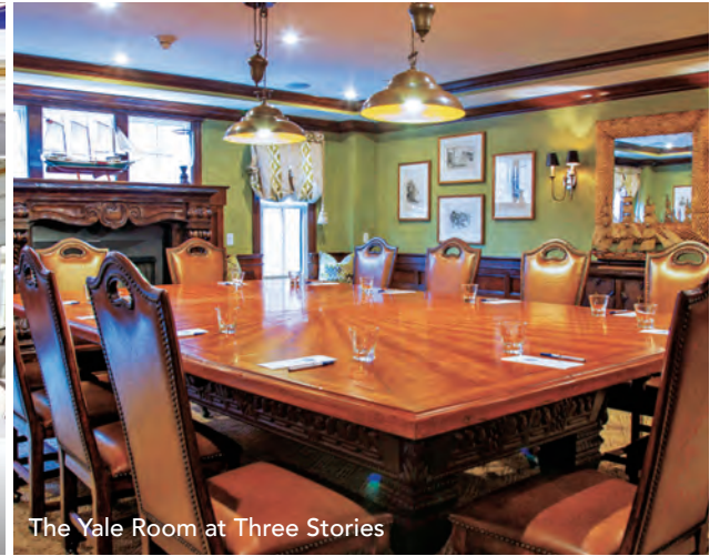
The Yale Room at Three Stories