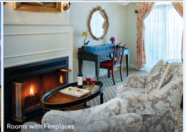
Rooms with Fireplaces