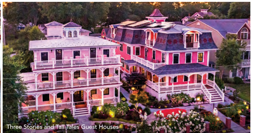
Three Stories and Tall Tales Guest Houses